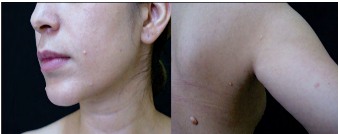
FIGURE 1. Multiple orange papules and nodules of different sizes, ranging from 0.5 to 2 cm located on the trunk, limbs and face